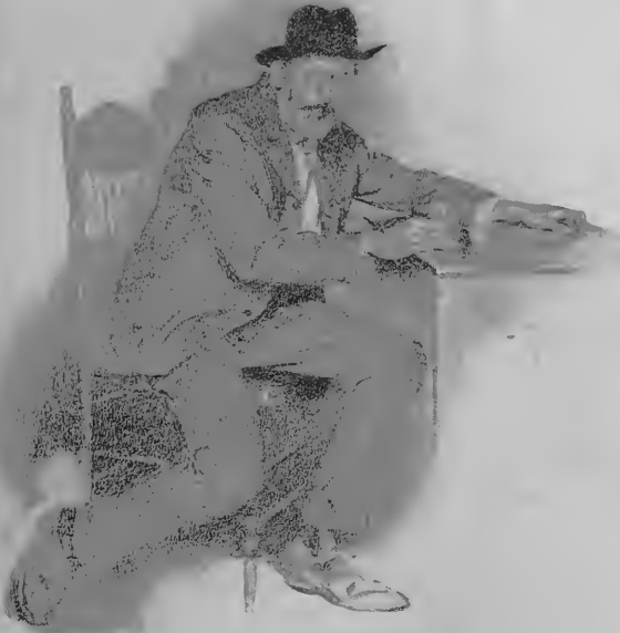
The Man Who Lost